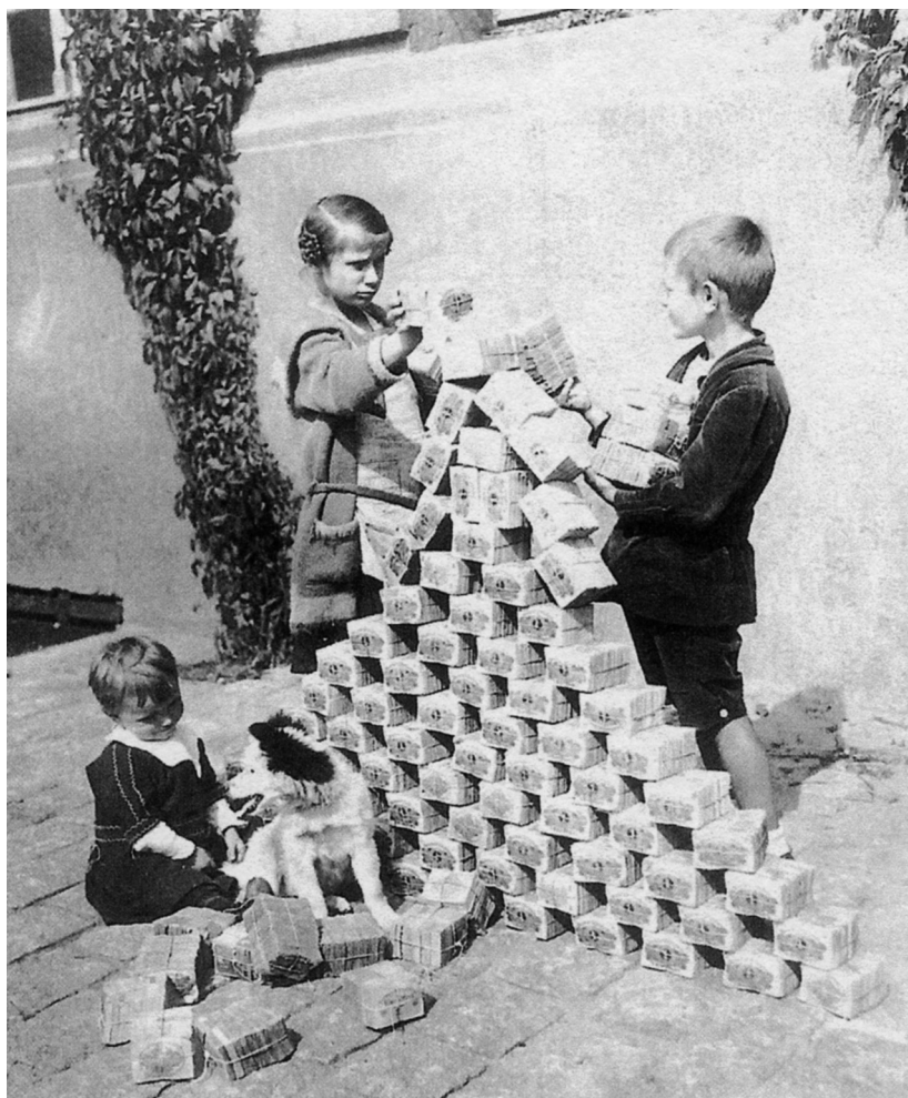
Children playing with bundles of money, 1923.